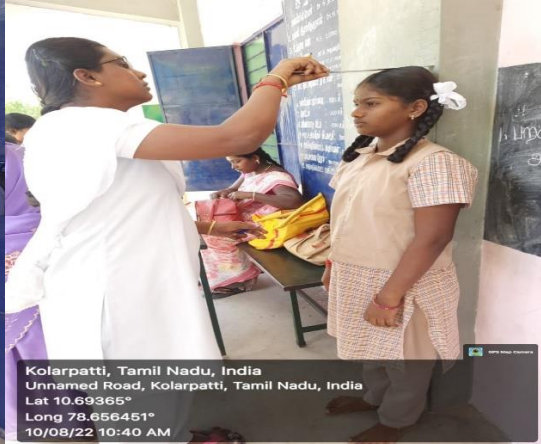
Kolarpatti, Tamil Nadu, India Unnamed Road, Kolarpatti, Tamil Nadu, India Lat 10.69365° Long 78.656451° 10/08/22 10:40 AM