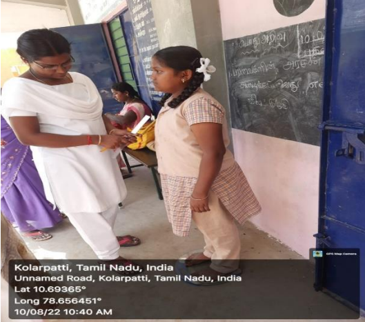
Kolarpatti, Tamil Nadu, India Unnamed Road, Kolarpatti, Tamil Nadu, India Lat 10.69365° Long 78.656451° 10/08/22 10:40 AM