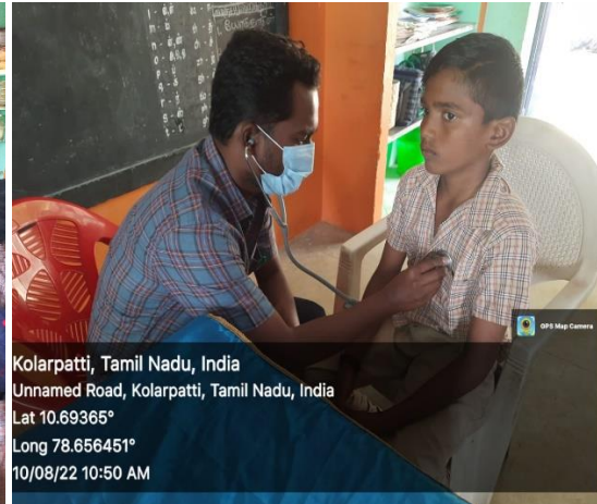
Kolarpatti, Tamil Nadu, India Unnamed Road, Kolarpatti, Tamil Nadu, India Lat 10.69365° Long 78.656451° 10/08/22 10:50 AM