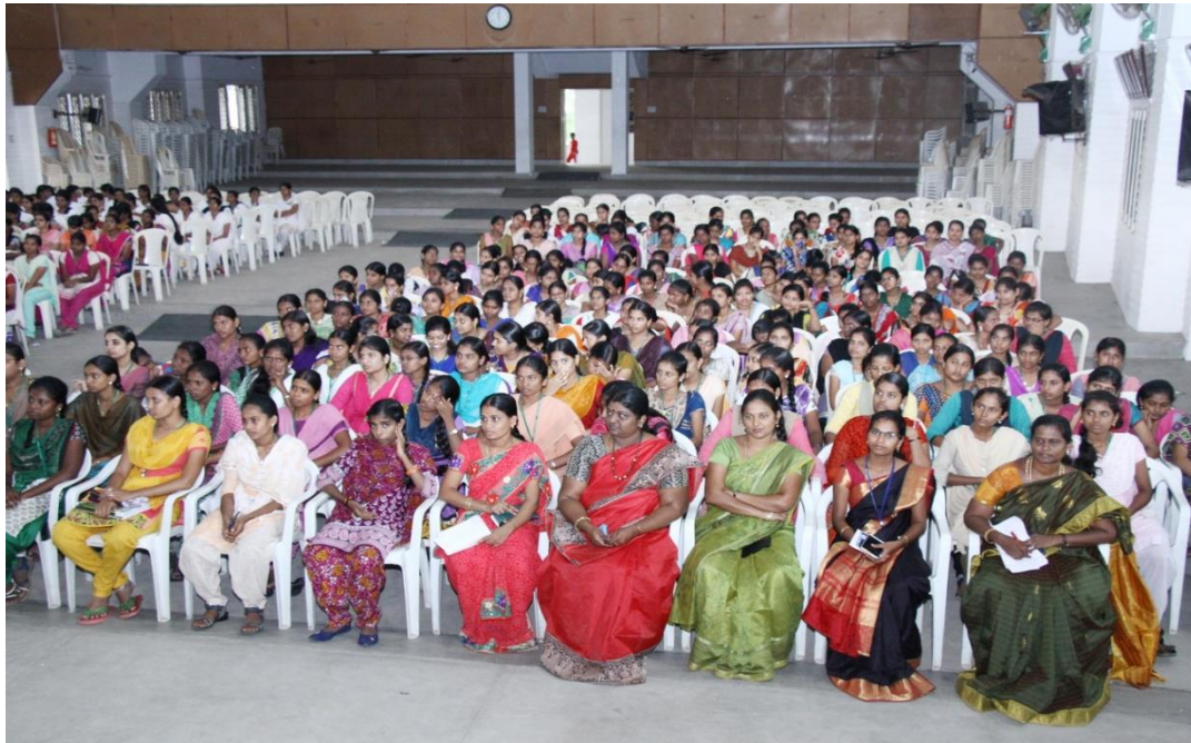
Legal awareness camp