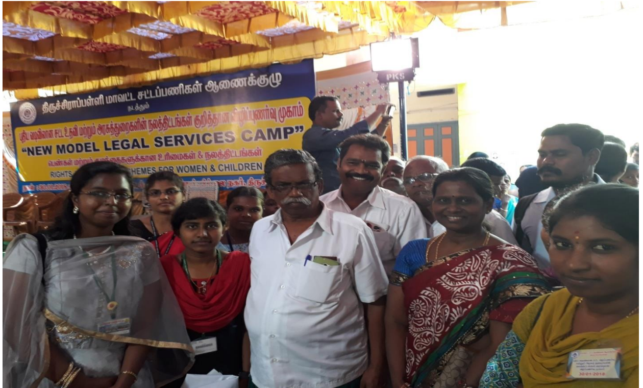
Members of the Legal Literacy Club Visit to New Model Legal Services Camp organised by District Legal Service Authority. Trichy.