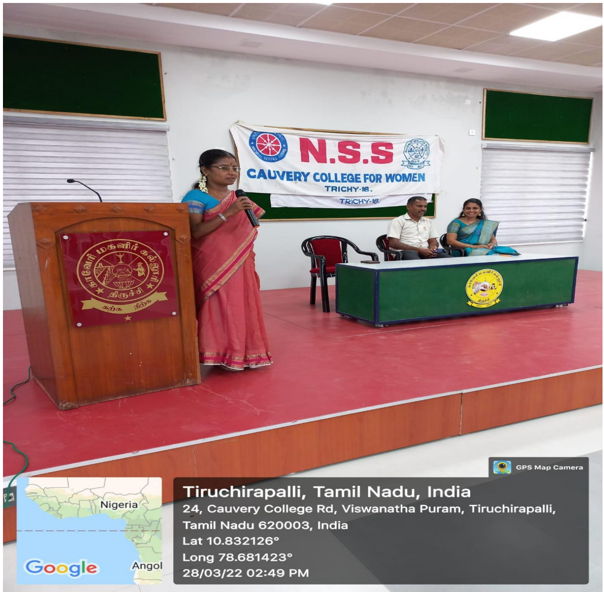
Active Participation of RRC Volunteers of Cauvery College for Women